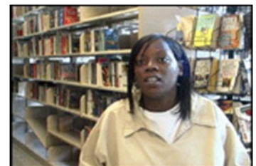
A scene from Freedom Road