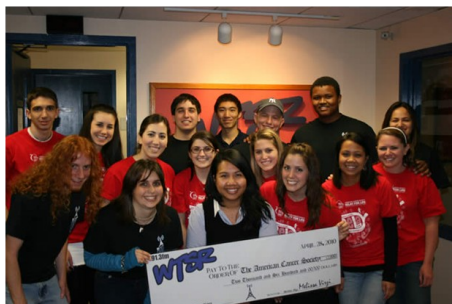
Members of WTSR hold the check with the amount of money they raised for the American Cancer Society

With the help of Kel Mitchell, the actor/comedian best known for his roles on Nickelodeon's "All That" and "Kenan and Kel," 91.3FM WTSR, the College's radio station, brought happiness and hope not only to members of the campus community, but also to the millions of Americans diagnosed with cancer every year.