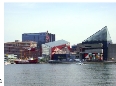
Scenic view of the waterfront from ECA's 101st annual convention at the Hyatt