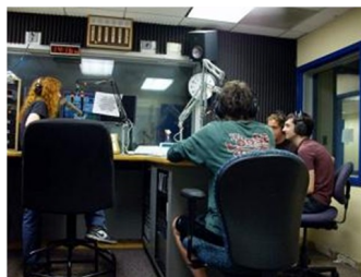
Students at work in the WTSR studios

The station now humbly accepts donations. Those interested in giving or learning more should contact the Development Office, "not only to see how to donate, but to let them know how important it [the station] was to you."