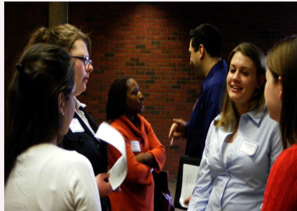
Students, faculty and alumni network at Alumni Day

In addition to providing valuable networking opportunities for both current and former students, the de-