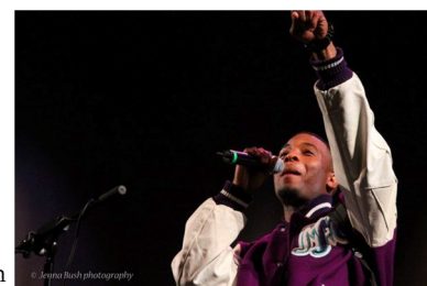
Kel Mitchell pumps up the audience at WTSR's "Laugh in the Face of Cancer"